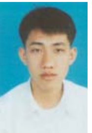
Bou Monorom [R]