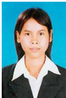
Chhat Savun [UME-BB]