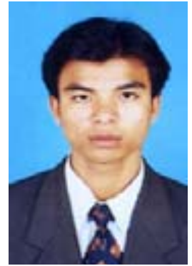
Im Chhunhor [NIE]