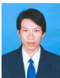
LIV, Yi Battambang (ITC, Mechanical) Special, CBS