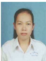
ROS, Hemvila Battambang (ITC, Rural Engr) General, CEEF