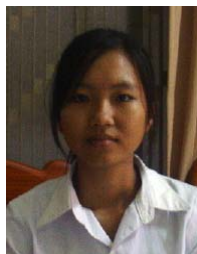
BUT, Channophea Battambang (RULE, Economics) Special, Anonymous [1]