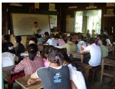
English class at Ek Phnom HS

A one-year pilot program has been created in partnership with the Khmer Center for Development (KCD). The CEE Foundation will provide financial assistance to 50 students to attend the evening English class at Ek Phnom High School in Battambang province. The program is administered by KCD for one year. The program will be evaluated for its success and sustainability before seeking further financing by the foundation.