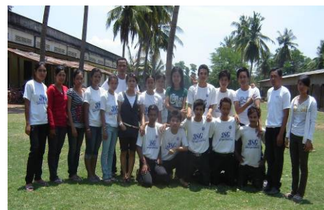
The Students Support Students Group (3SG)

Those students must graduate from this high school in 2008 and must meet all selection criteria as set forth by CEE Foundation. In partnership with the Khmer Center for Development (KCD), this latter agrees to facilitate the application process, and the disbursements of scholarship fund. The KCD and its affiliated student group, named Students Support Students Group (3SG), will serve as promoters and motivators for the prospective scholarship recipients. For more information, click here .