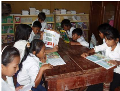
A school library in Banteay Meanchey

KBA will assume full financial responsibility for the functioning and maintenance of the library. See "open letter" from CEE Foundation's President on page 8. For more information, click here .